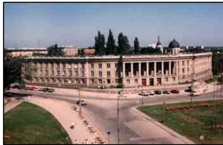
The University of Białystok, Philological Faculty

The University of Białystok, young and dynamic, will host the event.