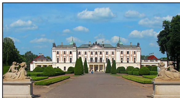
Branicki Palace, the landmark of Białystok

The conference will be held in Białystok, the city of L. L. Zamenhof, the creator of Esperanto, a multicultural place, whose turbulent history marked its presence everywhere.